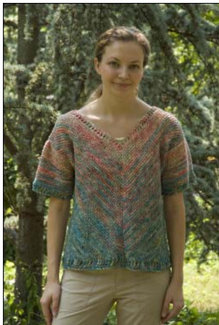
Dawn Diagonal Top