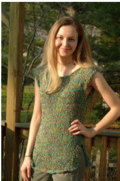
Easy Apple Top