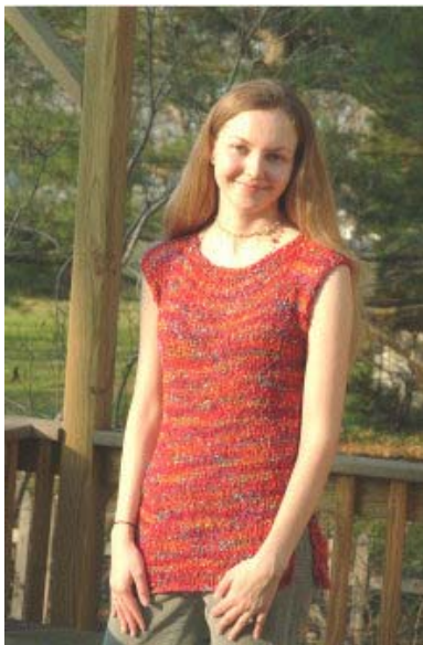
Easy Tulip Top