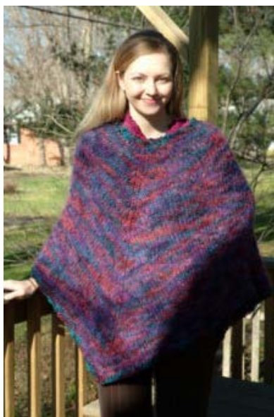
Mohair and Wool Seed Poncho - Berry