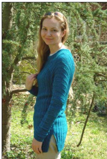
Ocean Long Sleeved Tee Top