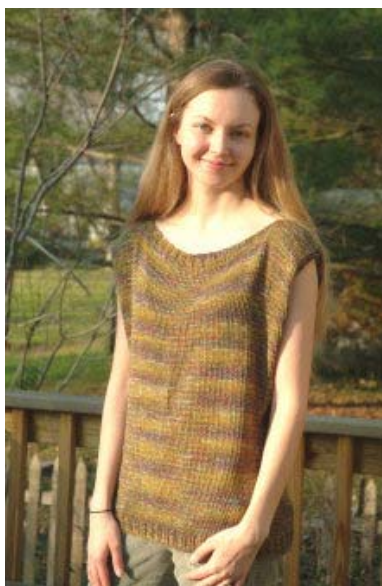
Old Gold Shell