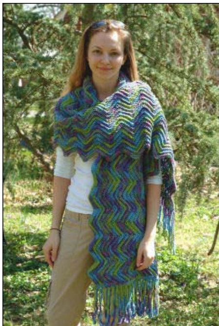
Rita's Zig-Zag Shawl