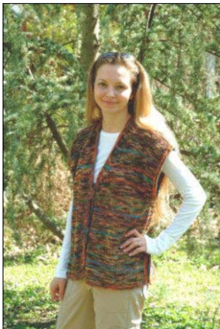
Short Wool Vest