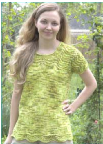
Silk/Merino Lace Shell