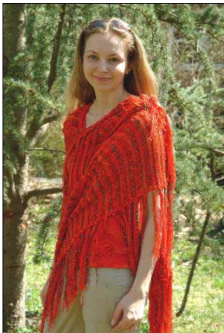
Summer Sun Shawl