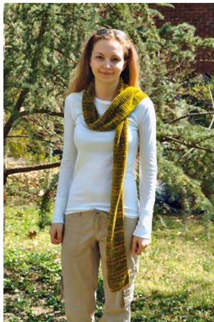
1 Skein BRC Scarf