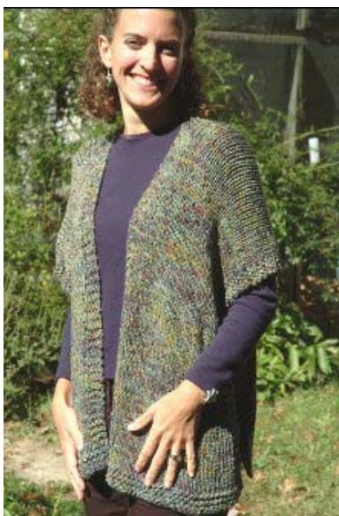
Antique Gold Cocoon