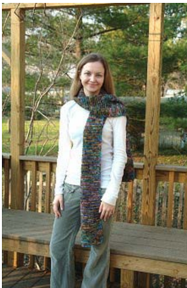
Beaded Wool Scarf