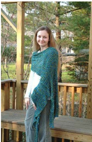
Blue Meadow Shawl