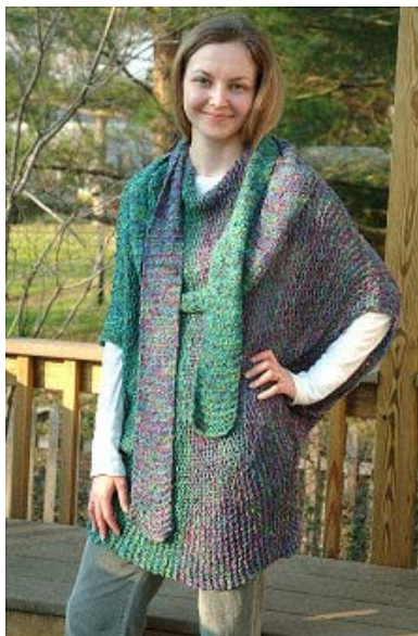
Bluegrass and Lilac Sweater