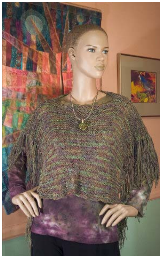
Cotton/Rayon Seed Shawl