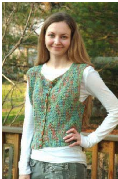
Crocheted Apple Vest

MATERIALS: 1 skein softwist rayon in Apple