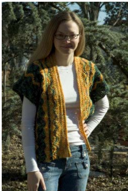
Crocheted Day/Night Jacket