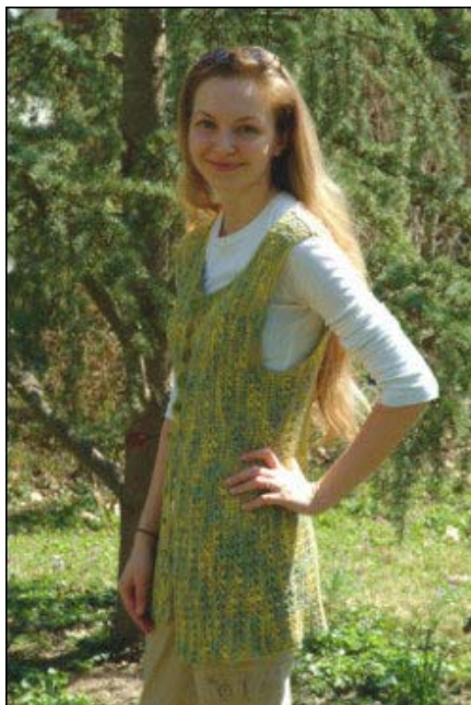
Crocheted Leaf Vest