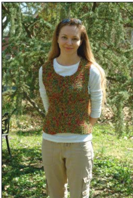
Crocheted Mossy Place Vest