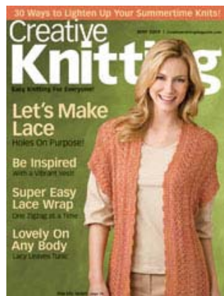
Day Lily Jacket