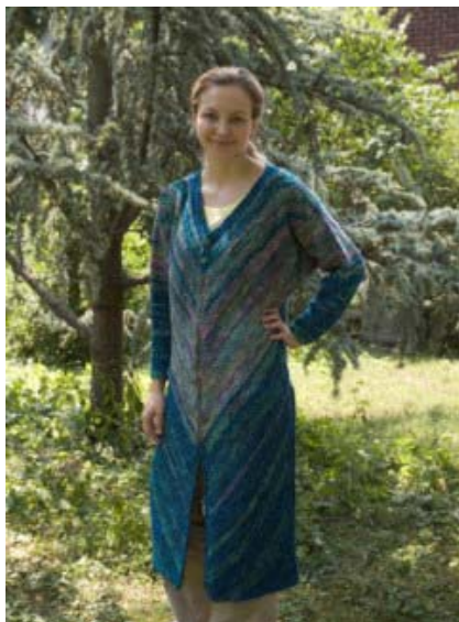
Deep Blue Sea Coat