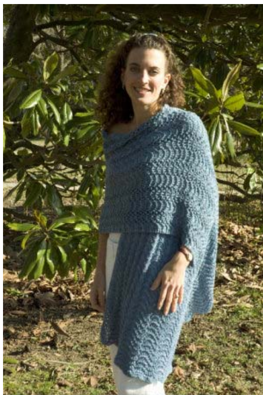
Easy Lace Shawl