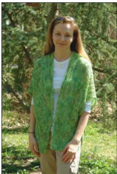
Lacy Lettuce Jacket