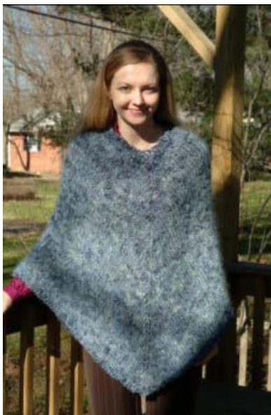
Mohair and Wool Seed Poncho - Denim

Shop > Ponchos > Mohair and Wool Seed Poncho - Denim