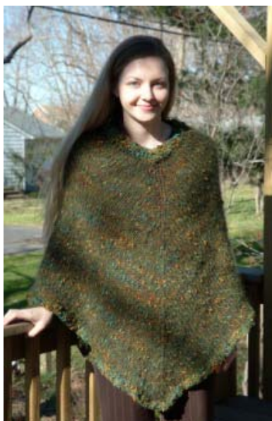
Mohair and Wool Seed Poncho - Woodpath