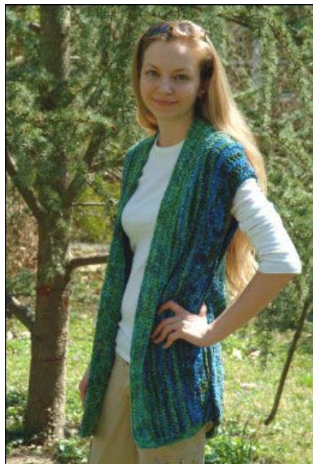
Ocean Chenille Vest