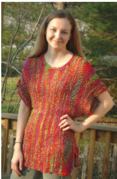
Rayon Loop Top