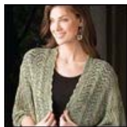
Sage Lace Kimono