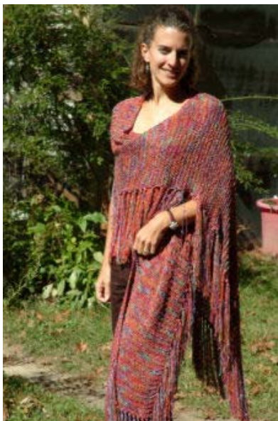
Sedona Sunset Shawl