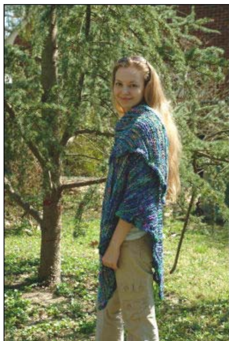
Spring Rain Shawl