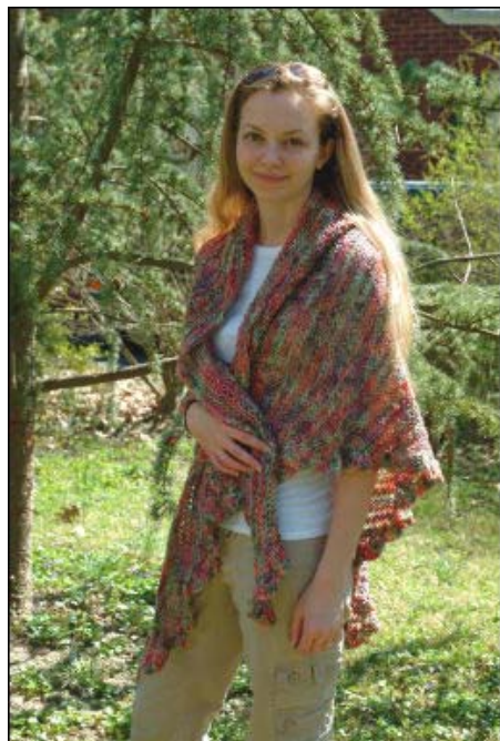
Spring/Summer Lacy Shawl