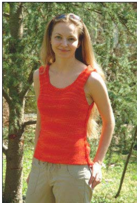
Summer Sun Top