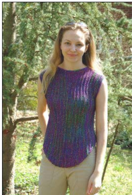
Violet Fields Camisole