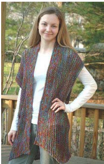
Water Hyacinth Vest and Scarf