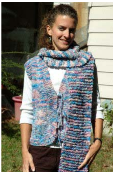
Wool Thick and Thin Vest